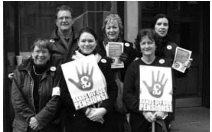
Pensions strike 28 March 2006.